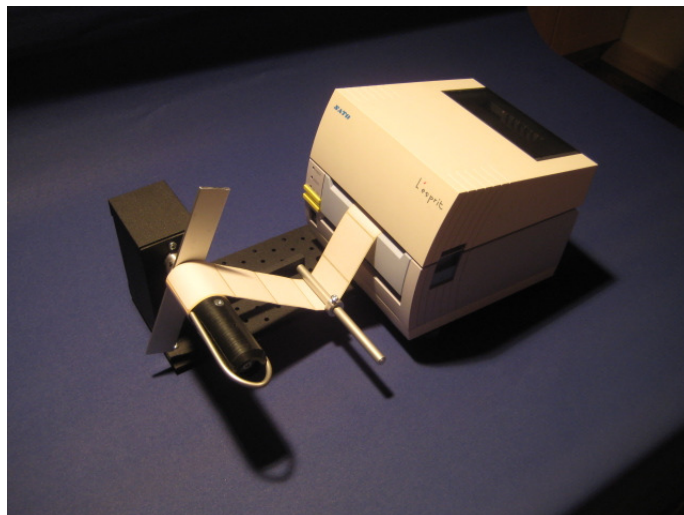
RW-S-LC with CT408

Note: Power supply included together with the Rewinder.